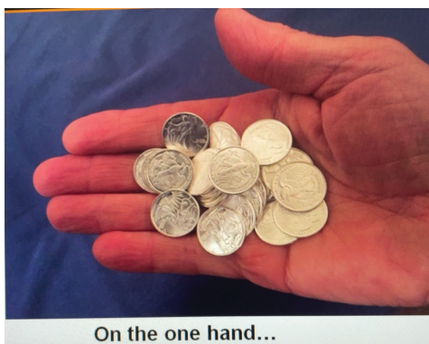
On the one hand...

Then, with the criteria you've established for yourself, make plans to layer out (in tranches) into the kind of strength that often characterizes blow off tops. But what if, as in the case of palladium a few years ago, the price