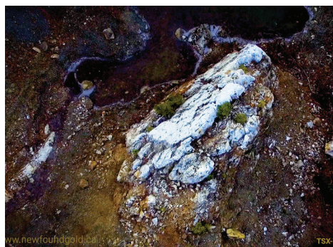
The Dome showing.

His brother, Al, spent the next ten years searching the area, and finally located "the dome" - a mineralized outcrop 3 km from where the boulder had come to rest -This protuberance, as Kevin Keats says, "made the rush happen - in Newfoundland."